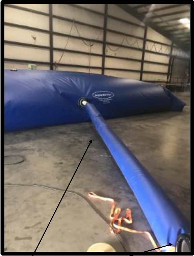
Air Tube Floor Blower