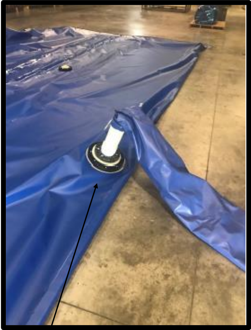
Customized Barrier Connection Fitting