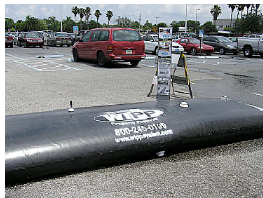
The WIPP on display at the Expo

The WIPP is made from vinyl and system heights range from 1 to 8 feet. It is designed for multiple installations and many years of service can be had if used the stored properly, the company's literature said. It can be permanently repaired if damaged. There are two types of WIPP: One is recommended for industrial and