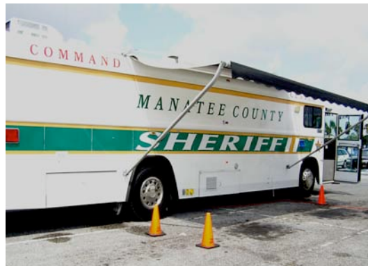
Manatee County Sheriff's Office Mobile Command Center

"Death to drug dealing killers," Mexican cult worshippers say