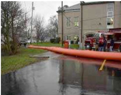
Customer purchased 167 feet of 2-ft high WIPP HD to prevent creek from flooding onto their parking lot

heavy commercial use and the other is recommended for light commercial or residential use. The residential type is made to be from 1 to 3 feet high.